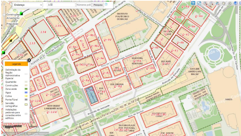
Figure 1 Smart streetlamps in Macau

According to field investigations and records, the current Smart streetlamps in Macau are only installed at the intersection of Avenida da Amizade(see Figure 1). This section is dotted with office buildings, schools, casinos and hotels of different heights. It is one of the busiest sections of the Macau Peninsula.