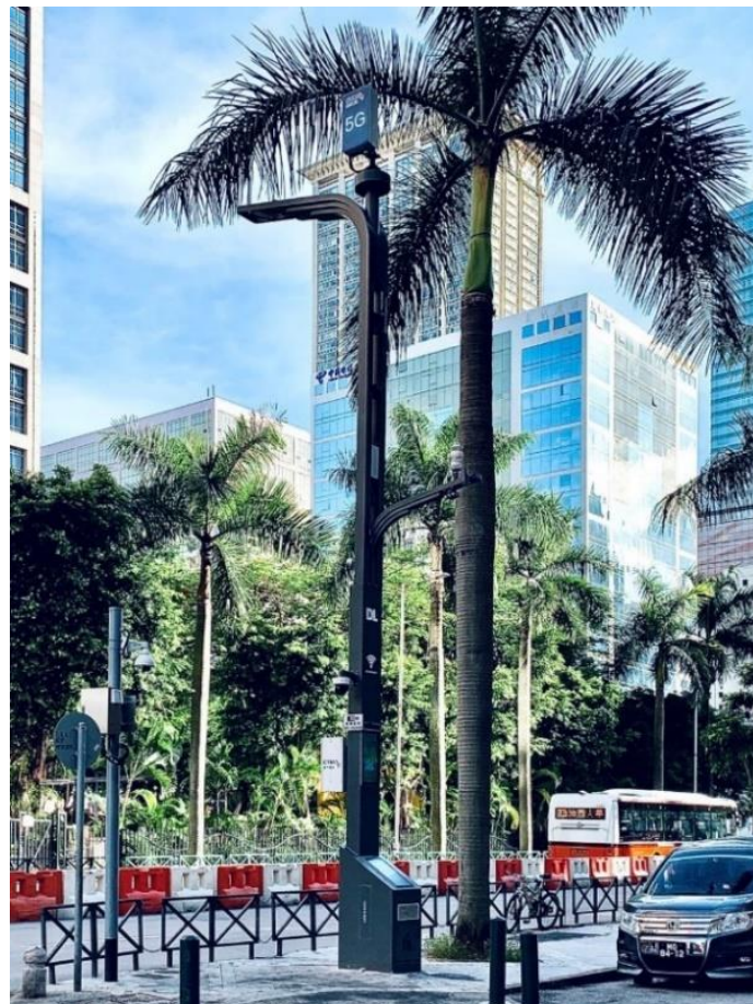
Figure 3 Smart streetlamps in Macau