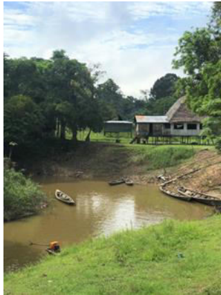
Figure 1 Rural Yanamono Community, Indiana, Peru

from the river. When built properly, many of these homes are resilient and can cope with extreme fluctuations in water including the increasingly severe impacts of climate change. However, poor environmental conditions and lack of infrastructure including water and sewer services have a negative impact on the health of these communities and the ecosystems they live within. (Alarcón, et al, 2018).