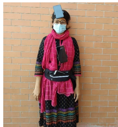
Fig. 2. Body positions of the used smartphone.

The uActivity algorithm enhances activity recognition accuracy in user-centric contexts using user-specific models, LSTM and Bi-LSTM architectures, adaptive moment estimation, and stochastic gradient descent with momentum optimization algorithms. The uActivity algorithm underwent a comparative analysis to assess its performance against other classification techniques, focusing on predictive accuracy, speed, robustness, and scalability.