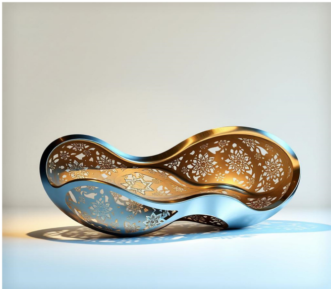
Fig. 2. The final sculpture, 'The Red Sea Mirage,' incorporates the AI's key suggestions.

The sculptor finally achieved the final design: "The Red Sea Mirage", a flowing, wave-like sculpture crafted from polished steel, with subtle laser-cut patterns that cast intricate shadows reminiscent of traditional Islamic art, as shown in Figure 2. The AI model provided evidence-based guidance, ensuring that the final artwork is innovative, culturally grounded, and predicted to be well-received by the Jeddah community.