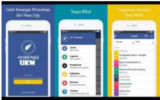
Figure 3. Simple Accounting Applications for SMEs on Android-based Smartphone

In addition to marketing and financial management, SMEs also can both utilize information technology for business development, by expanding the network so that information to be obtained is also growing. Ministry of Cooperatives and SMEs have launched the App Center for Integrated Services of Smesco or Integrated Business Service Center of the National KUKM (CIS-Plut-KUMKM). With this application is expected that the Plut-KUKM Facilitation Consultant can actively input data that accompanied the development of SMEs, making it easier for stakeholders such as the Ministry of Cooperative and SMEs, as well as other stakeholders in accessing the data (www.depkop.go.id, 2017).