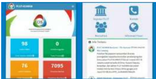
Figure 4. Applications CIS-Plut of the Ministry of Cooperatives and SMEs

In addition to marketing and financial management, SMEs also can both utilize information technology for business development, by expanding the network so that information to be obtained is also growing. Ministry of Cooperatives and SMEs have launched the App Center for Integrated Services of Smesco or Integrated Business Service Center of the National KUKM (CIS-Plut-KUMKM). With this application is expected that the Plut-KUKM Facilitation Consultant can actively input data that accompanied the development of SMEs, making it easier for stakeholders such as the Ministry of Cooperative and SMEs, as well as other stakeholders in accessing the data (www.depkop.go.id, 2017).