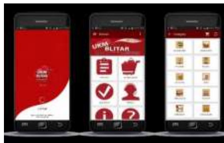
Figure 2. Application Blitar SMEs as SME Product Purchase Forum Blitar

In addition to using social media, SMEs in Kota Blitar also be able to market their products through an online store, such as: Tokopedia, Lazada, Open Stalls, Shopee, and others. To face global competition and improve the well-being of SMEs in Kota Blitar, Blitar Center, Sedulur SMEs Blitar and Bank Jatim also have collaborated to provide Android-based mobile applications that can be a means of buying and selling for SMEs in the city of Blitar. If all SMEs in Blitar can access and utilize this application properly, it will greatly assist the growth and development of SMEs in the city of Blitar.