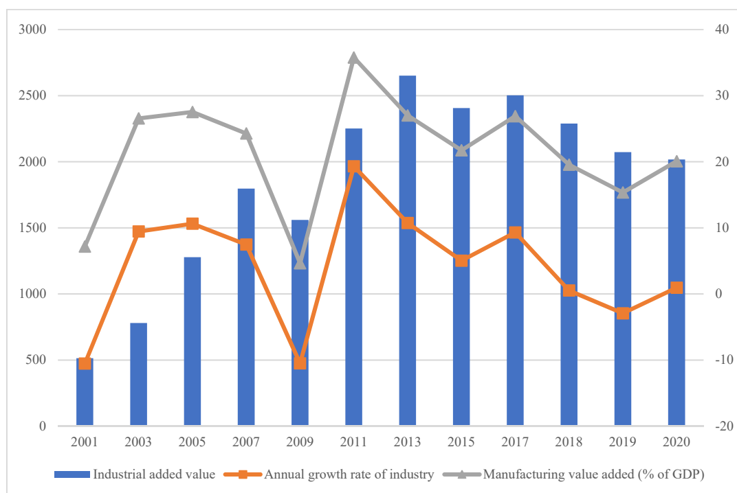
Figure 3. Growth of Turkey's industrial and manufacturing industries, 2001-2020

economic growth relies too much on the service industry, and the service industry's ability to resist risks is obviously weaker than agriculture and industry, war, epidemic and other factors will seriously affect the service industry. In Turkey's service sector, tourism occupies a major position, and the decline in inbound tourism after the military coup in 2016, coupled with the ongoing unrest in the Middle East, Turkey's tourism industry is increasingly difficult to sustain. In addition, the outbreak of the novel coronavirus has again hit Turkey's service industry, and the rapid depression of the service industry is one of the important reasons for Turkey's economic decline in recent years.