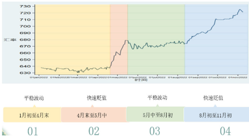
Figure 2. Stage-by-Stage Line Chart of RMB-Dollar Exchange Rate in 2022