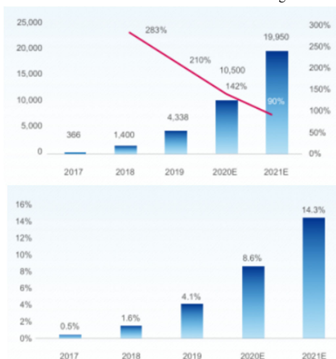
Table 1. Trend chart of live broadcast with goods

However, while the market is booming, some problems also follow. With the rise of the e-commerce live broadcast industry, more and more consumers gradually accept live e-commerce. However, many problems existing in e-commerce live shopping can not be ignored, such as commodity quality