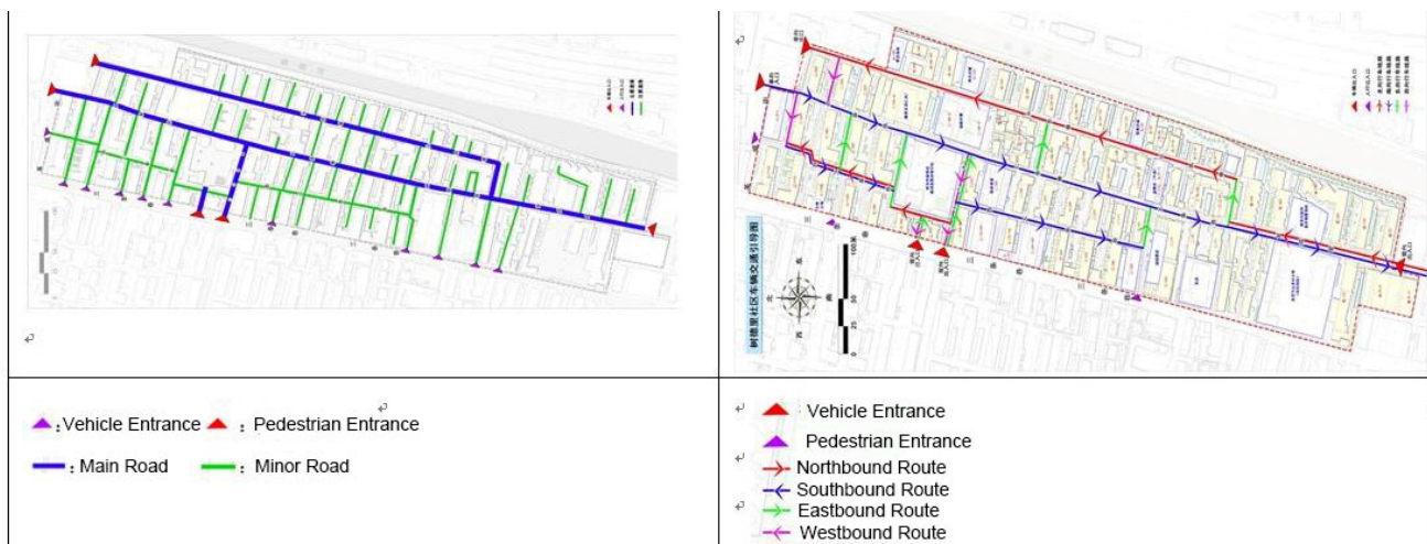
Figure 2. Traffic roads in Shudeli community before and after remediation

(2) Re-plan the traffic routes in the area, transform all traffic lanes into one-way roads, and close 7 unnecessary, narrow entrances among the original 17 entrances. After such reconstruction, 175 parking spaces can be yielded. As shown below, the left part represents Shudeli community before the remediation, while the right part represents Shudeli community after remediation.