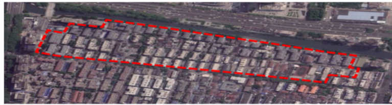
Figure 1. Basic information about Shudeli Community

by residents who live in Shudeli community, (2) regular external parking by people who work in two nearby public institutions and the surrounding shops (3) irregular external parking.