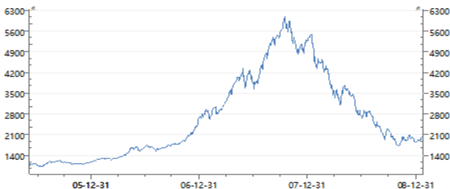
Figure 1. Chart of Shanghai Composite Index (June 2005-October 2007)

began to fall sharply, from 6,124 points to 1,664 points in one and a half years, with a drop of 73%. [33]