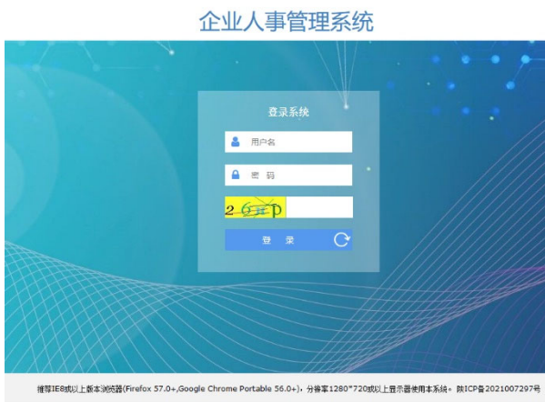
Figure 2. System login example

(5). Clients that are not on the whitelist cannot be accessed. The system login interface is shown in Figure 2 :