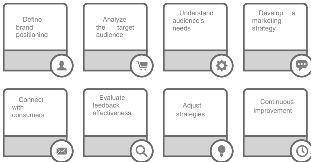
Figure 1. Connection Process between Brand and Target Audience