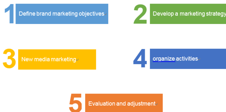
Figure 2. The basic process of strengthening brand marketing and publicity

Under the consumption downgrading trend, it is necessary to strengthen brand marketing and promotion. By comprehensively using advertising, public relations, content marketing, and other means, retailers can effectively enhance their brand image and visibility. Advertising is an important part of brand marketing. Through well-planned advertising campaigns, retailers can quickly attract the attention of a large number of consumers. Public relations activities focus on long-term benefits, shaping a good brand image and reputation through media relationship maintenance and crisis management. Content marketing is a gentler and more enduring marketing method that attracts and retains consumers by providing valuable content. With the rise of new media, platforms such as social media and short videos have become new battlegrounds for brand marketing. By using these platforms, retailers can interact more directly with consumers, convey brand values and philosophies, and enhance consumer identification with and loyalty to the brand. Additionally, organizing promotional events and sponsorships is an effective way to increase brand exposure and influence. Promotional events can attract consumer attention and stimulate their desire to buy, thus standing out in fierce market competition, as shown in Figure 2.