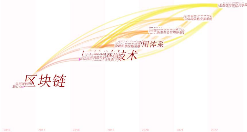
Figure 3. Time zone map of high-frequency keywords for research in the field of "blockchain + credit investigation" in China