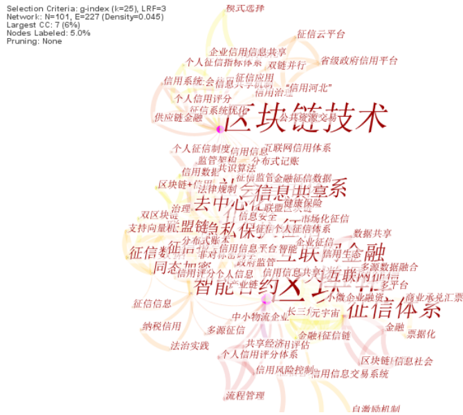
Figure 2. Graph of high-frequency keywords in the field of "blockchain + credit investigation " in China