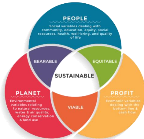
Figure 3. The Triple Bottom Line

the planet (the sustainability component), and profit (the monetary component) to achieve long-term success as seen in Figure 3 [10].