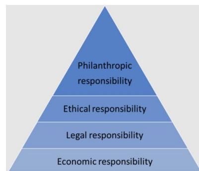
Figure 4. The Pyramid of CSR