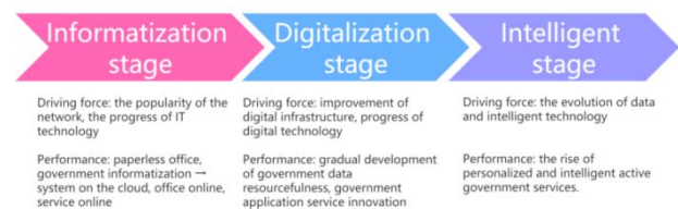
Figure 2. Trends in Digital Government

The positive effects of big data on government governance [8]. First, the quantity and quality of government data have been greatly improved. Data sources in the public affairs field are constantly enriched, data accuracy is constantly improved, and a "data tsunami" is coming to public management. Secondly, it is changing the behavior pattern of the government. National governance emphasizes the dual diversity of governance subjects and governance tools, and the resulting holistic governance theory and digital governance theory show that in the era of big data, actively promoting citizens' participation in public governance activities not only makes it possible to open government information and improve government transparency, but also effectively fights corruption. Third, big government data becomes an effective tool in public governance activities. With the help of advanced big data resources and information science and technology, government decision-makers can fully explore information from massive data, understand and judge the economic and social development trends, thus improving the efficiency of public decision-making and continuously promoting and enhancing the construction of smart cities.