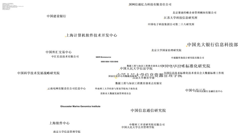
Figure 2. Visual map of core institutions of Data Governance Research

Information Resources Management of Renmin University of China, Information Technology Department of China Everbright Bank, China Institute of Electronic Technology Standardization, Information Resources Research Center of Wuhan University and China Academy of Communications. Specifically, most of the five major publishing institutions are scientific research institutions, and only two are university information resources research institutions. According to the knowledge graph, the connection between research institutions is loose. However, the lack of communication of research results is easy to lead to lagging research development. At present, the exchanges and cooperation of research institutions can be strengthened to promote the continuous development and progress of data governance research.