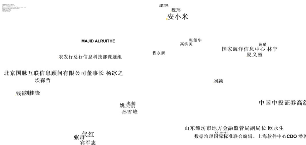
Figure 3. Cooperative visualization atlas of the Core authors of Data Governance Research

governance at home and abroad: connotation, elements, model and framework (2017.12). By analyzing the distribution data of the research authors related to data governance, we can find that most of the existing studies on data governance focus on the construction of government data governance research and data governance research model, which reflects the lack of rich data governance research to some extent. In addition, it is known that although the research on data governance is gradually increasing, the authors studying issues related to data governance are in a minority compared with other studies. This shows that the domestic research on data governance is not mature and the attention is not high. As is also known from the atlas, the authors are more independent, and have less cooperation between the authors and the authors. High-level paper publication requires in-depth cooperation. Therefore, based on the current research situation, researchers should start from reality, seek cooperative joint organizations or cooperative institutions to strengthen relevant research and expand the research team.