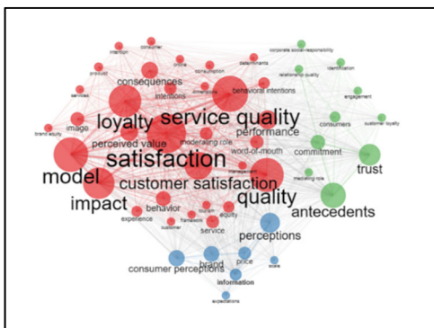
Figure 1. Clustering diagram of keywords in international literature