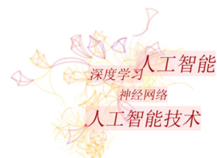
Figure 1. Keyword Co-occurrence Network Graph

Keywords are the main content of an article and the research direction of the article. The keyword co-occurrence network graph is composed of the keywords provided by the authors and the keywords identified by the journals.