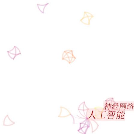
Figure 3. Keyword Clustering Knowledge Graph 2006-2015

In the initial exploration stage of artificial intelligence technology, there are two keywords that appear most frequently, namely "artificial intelligence" and "neural network" (Figure 3). The correlation between keywords is relatively small, and the research topics are relatively scattered.