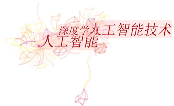
Figure 4. Keyword Clustering Knowledge Graph 2016-2021

keywords are strengthened and the research topics are more concentrated.