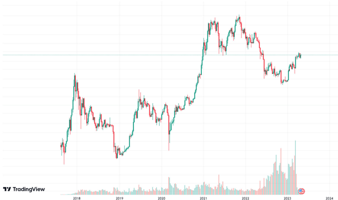
Figure 2. The price of Bitcoin

investors choose to put funds into the cryptocurrency market to reduce the impact of risks, which led to the sharp rise of Bitcoin this time.