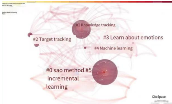
Figure 3. Keyword co-occurrence map of knowledge tracking research based on deep learning in China from 2012 to 2022

promoted the rapid development of knowledge tracking applications. Since the introduction of deep learning into knowledge tracking, knowledge tracking has developed by leaps and bounds, and more and more emerging intelligent technologies have been integrated into knowledge tracking, which provides new ideas and opportunities for further promoting the development of intelligent education.