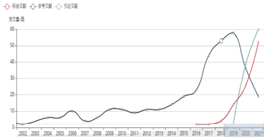
Figure 1. Annual changes in the number of papers on knowledge tracking based on deep learning from 2002 to 2022

based on in-depth learning can be traced back a long way, from the global research point of view, the focus of knowledge tracking in 2015 began to shift from the traditional probability model to in-depth learning. Piech (C. Piech) et al. [4] of Stanford University first introduced the Long short-term Memory (LSTM), a variant of recurrent neural network, into the knowledge tracking task, and proposed the first deep knowledge tracking model. In 2016, he published the first Chinese research results in related fields in China.