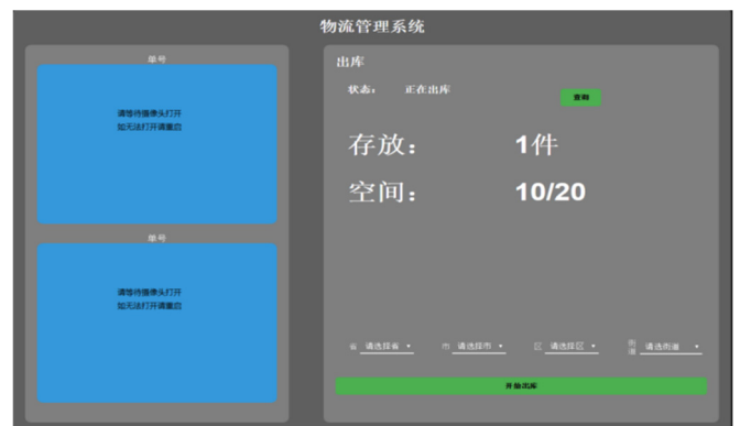
Fig 3. Logistics management system operation interface

In order to verify the reliability of the system, the normal operation test and abnormal test are carried out.