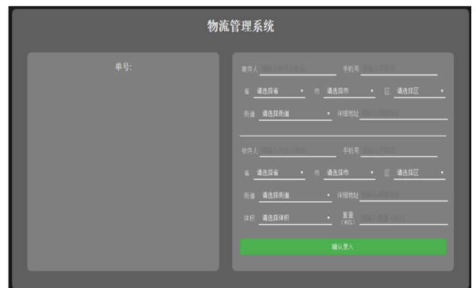
Fig 2. Logistics management system entry interface

When the GD32F103 is powered on, start the QT application. Enter the login information on the QT side to complete the connection with Ali intelligent cloud platform. After the device is successfully connected to the cloud platform, the QT side can display the entered express related information in real time [7]. As shown in Figure 2, it is the input system of express delivery. After scanning the code, you can enter the mailing address and receiving address. If the input information is correct, the automatic pop-up window will indicate that the input is successful. As shown in Figure 3, logistics management system, select shipment, check the address, the system will automatically push out the corresponding express, after the end, the system pop-up window prompts the end of shipment. The running interface shows the real-time status of the system, including the current status of the express (such as entered, sorting, sorting completed, etc.), the network connection status and the running status of the hardware module.