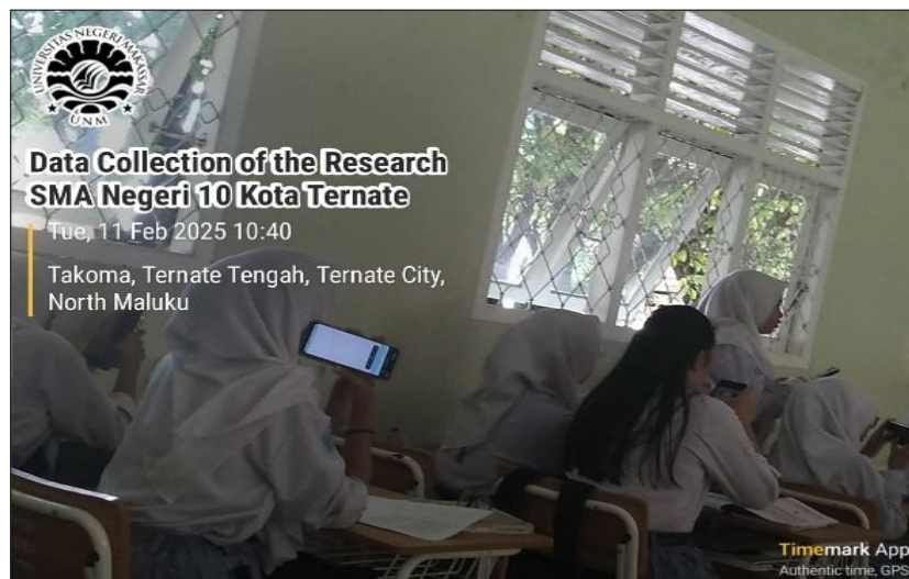
Figure 2. Learner-content interaction in EFL classrooms

The evidence illustrated in the preceding figure indicates that, in addition to the teacher supplying material links or video content prior to classroom instruction, student involvement with the learning materials also transpires during the lesson. The instructor disseminates student worksheets (LKS) with questions to be addressed collaboratively in pairs during class. The teacher projects instructional films from YouTube, which students access on their iPhones. This suggests that material-student interaction in digital literacy education can occur flexibly and dynamically throughout the learning process. This trend indicates that learner-content interaction in digitally enhanced contexts improves engagement, facilitates differentiated instruction, and promotes learner autonomy. Its effectiveness, however, depends on regular direction and organized reflection provided by instructors, ensuring that technology serves as a means to enhance understanding rather than a distraction.