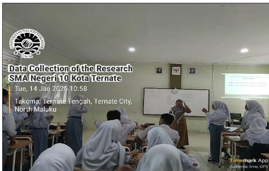
Figure 3. Learner-instructor interaction in EFL classrooms

The picture above illustrates that interaction between students and the teacher occurs through several means, including the introduction of the lesson topic at the beginning of class, delivering directions to students, and encouraging their engagement in learning activities. Furthermore, engagement transpires through question-and-answer interactions between the instructor and students regarding the topic matter under examination. These interactions illustrate a supportive scaffolding framework in which the teacher transitions from being the exclusive source of knowledge to a facilitator and guide. Furthermore, instructor engagement maintains student motivation, guarantees accountability in digital assignments, and meets the cognitive challenges of navigating online material. In classes where digital resources are not adequately utilised, both students and teachers recognise the potential for improvement. This interaction type is essential for fostering students' confidence in utilizing digital resources and acts as a conduit between independent content engagement and collaborative interpretation. The data highlight that significant teacher-student engagement is not lost through digital tools, but rather improved when they are deliberately integrated with pedagogical intent.