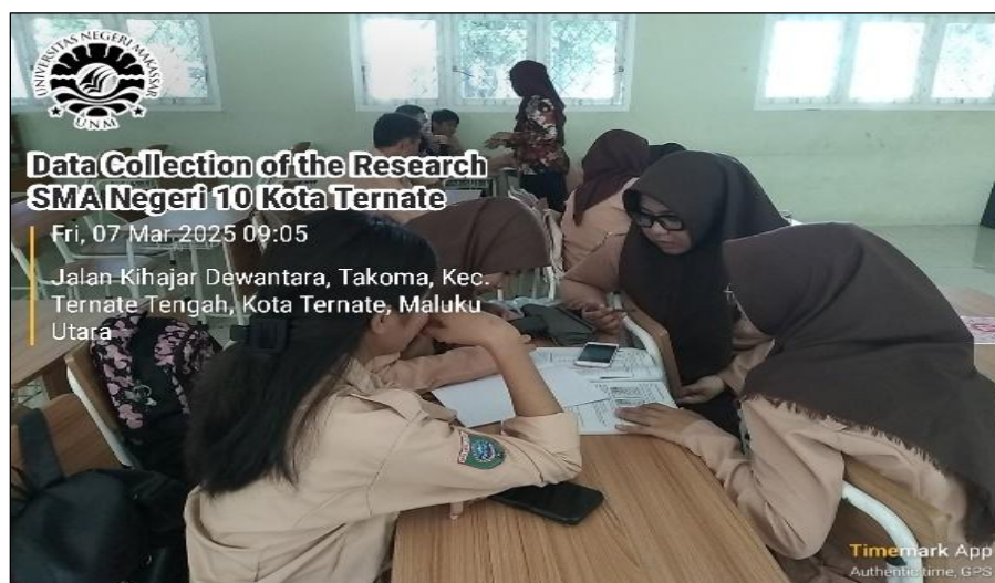
Figure 4. Learner-learner interaction in EFL classrooms

The observations reveal varying levels of participation, with highly engaged students taking on leadership responsibilities, while others contribute less prominently. This underscores the necessity for pedagogical practices that guarantee equal engagement. Interaction among learners is crucial for enhancing comprehension, critical thinking, and communication skills, which are essential components of digital literacy. When correctly enabled, these interactions enhance content processing and promote learner autonomy. In summary, student collaboration, facilitated by digital technologies and organised group activities, fosters a dynamic learning environment that enhances and strengthens interactions among learners, with both learners and content, as well as between learners and instructors.