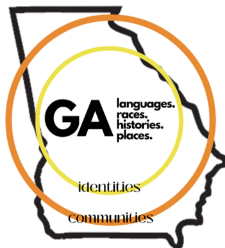
Figure 1: Linguistic Justice Collaborative's Framework

schooling that centers local communities and remains accountable to community goals above (and sometimes in opposition to) standardized goals for learning. In other words, we view schooling as spaces that prepare youth for college, career, and community. Preparing learners to be active, current citizens in their own communities includes an active exploration of community languages, literacy practices, and understanding the histories that both create, erase, and sustain these communities. These beliefs are summarized in the guiding framework: Georgia languages, Georgia races, Georgia histories, and Georgia places (Figure 1).