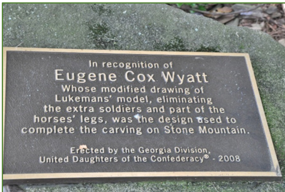
Figure 5: Using Community Resources, Example 3

Note. Here, a donated monument is a curriculum for learning history and critical literacies.