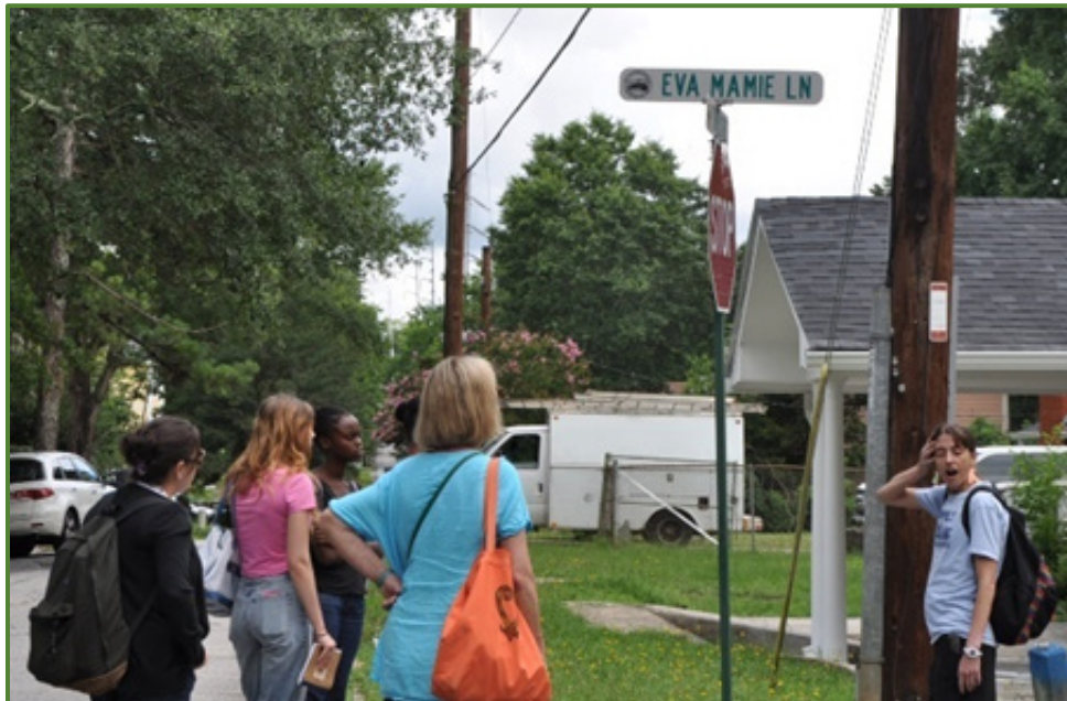
Figure 3: Using Community Resources, Example 1

Note. Here, a street sign is a curriculum for learning history and historical literacies.