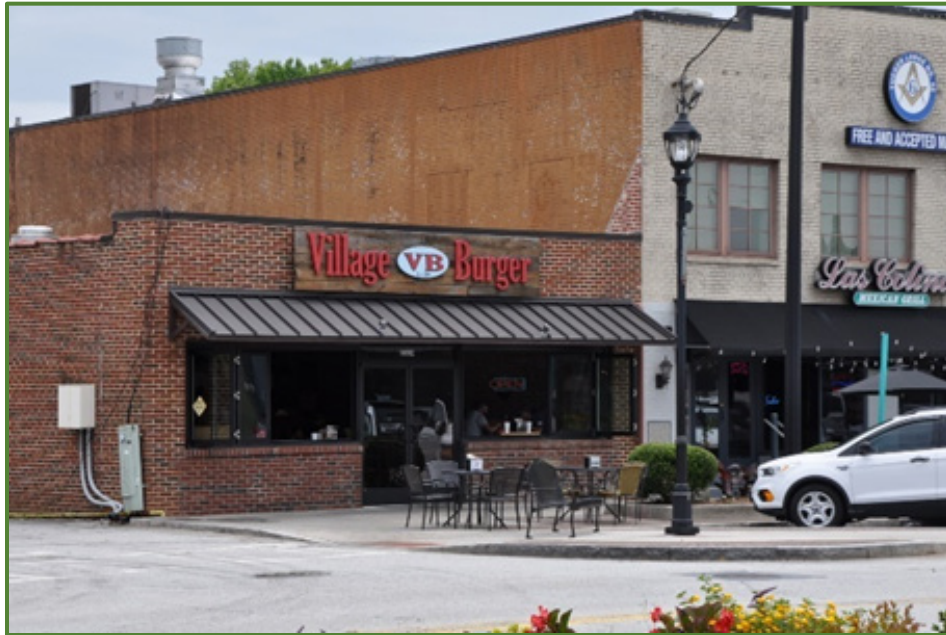
Figure 4: Using Community Resources, Example 2

Note. Here, architecture is a curriculum for learning economics and financial literacies.