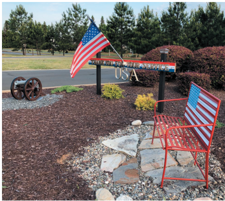
Veterans tribute park in South Carolina