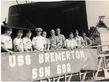
AFOS members touring USS Bremerton submarine