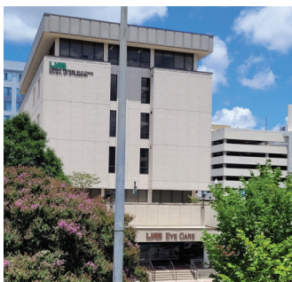
Front entrance of UAB School of Optometry.