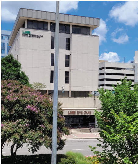
Front entrance of UAB School of Optometry.