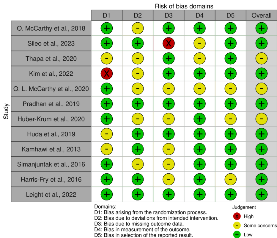
Figure 2. Traffic light risk of bias plot of ROB2 assessments created using robvis and the color-blind palette.

Intervention through healthcare workers has an important role in increasing contraceptive use and reducing the unmet need for contraception. Research in Nepal shows that training healthcare workers can improve their knowledge and ability to provide post-natal contraceptive counseling. 10 This shows that appropriate training can help health workers provide quality contraceptive services. Other research in Nepal suggests that postpartum counseling and IUD insertion can increase demand and help women manage the spacing between pregnancies. 13 This suggests that interventions that focus on long-term contraceptive methods can help reduce the unmet need for contraception. In Indonesia, structured counseling has been proven to be able to increase knowledge, attitudes, and use of modern contraception among couples of childbearing age. 17 This shows that effective counseling can help women and men choose and use appropriate contraception. In Jordan, the client-centered family planning service intervention: “Consult and Choose” (CC) was shown to be effective in increasing contracep-