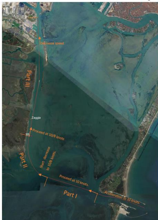
Figure 1 Overview of the MMC, the three main cross-sectional parts and the modelled speed profile.

Loss of sediment from the Lagoon of Venice has been a well-known problem for many years. The erosion has been pronounced in the central part of the lagoon, where the navigational channel leading from the Malamocco Marghera Mouth to the industrial harbour of Marghera on the mainland west of Venice is also located, see Figure 1.