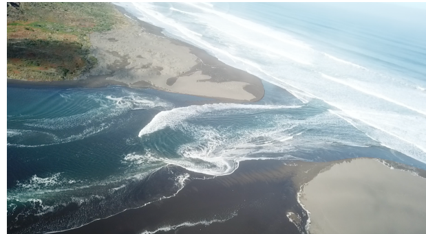
Fig. 2: An infragravity wave motion penetrating into the shallow lagoon during the tidal flood cycle of August 1 st 2023.

In the present contribution, we present field measurements of infragravity waves penetrating into a shallow bar-built estuary located in the Pacific border of Central Chile ( 34.48^{\circ}\text{S} , 72.00^{\circ}\text{W} , see Figs. 1 and 2). We show that the shallow and narrow canal connecting the river to the sea acts as a natural low-pass filter for swell frequencies, as it has been previously documented (Williams et al., 2016; McSweeney et al., 2020). The quasi-periodic entrance of infragravity motions into the estuary evolve over a shallow bathymetry as highly nonlinear long-waves that fission into solitonic wave trains. The statistical analysis of the measured wave heights show that the resulting field is of strongly non-Gaussian nature, with a frequent appearance of rogue waves (see Fig. 3).