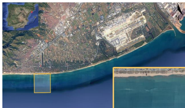
Figure 1 - Castelldefels beach, Catalonia, Spain.

The study site is Castelldefels beach, on the Catalan coast (NW Mediterranean). This beach is a microtidal, deltaic, open beach, with its sediment mainly supplied by the Llobregat river, located approximately 6 km to the NE of the study area (Figure 1). Over the past 13 years, numerous bathymetric surveys have been conducted along this beach. Furthermore, the input data for wave time series is obtained from a SIMAR node data set, which employs wave reanalysis performed by Puertos del Estado (Spanish government). Sea level data is obtained from the Barcelona harbor tide gauge.