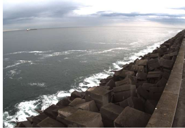
Figure 1 - Breakwater of Punta Lucero (Bilbao, Spain)

methods. As clearly stated by Stagnitti (2023) “Despite of the advances of numerical CFD [Computational Fluid Dynamics] models, physical modeling still remains the most reliable methodology to study the complex interactions between water flows and rubble-mound structures”, the literature still recognizes that breakwater physics is to be out of reach for numerical models. The authors acknowledge that ground-truth must be gathered from physical modeling yet, which continues to be fundamental for meeting structural requirements and underpins current standards, but, nonetheless, numerical modeling techniques have consistently evolved to enhance breakwater performance predictions. Recent advancements in numerical modeling have produced high-fidelity solutions capable of addressing hydrodynamic challenges for breakwaters, regarding both wave overtopping and breakwater stability.