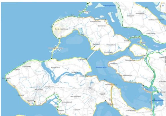
Figure 1 - Current safety assessment of the primary defenses at the southwest delta. The green lines are primary defenses that fulfill the current safety requirements. In yellow those that are acceptable and in orange are the primary defenses that do not satisfy safety requirements.

Both analyses will provide an overview of the spatial dependencies of extreme environmental conditions, which are essential in understanding the Dutch southwest delta system.