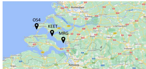
Figure 2 - Location of the two datasets.

Measurements of water level and wave height are collected every 30 minutes and provided by the Dutch Ministry of Infrastructure and Water Management.