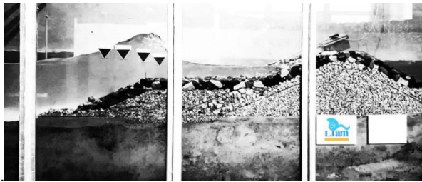
Figure 1 - Experimental test on wave run-up at rubble mound breakwater with submerged berm at the University of L'Aquila.

To investigate the role of the submerged berm on the wave run-up phenomenon, a series of 2D experimental tests is being carried out at the Environmental and Maritime Hydraulic Laboratory (Llam) of the University of L'Aquila (see Figure 1).