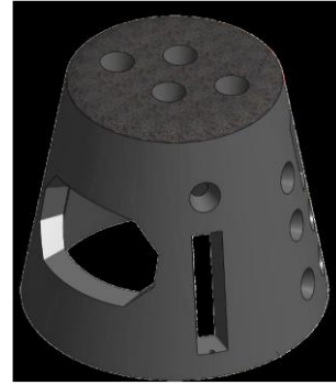
Figure 1: Porous artificial reef module - Bombora (MMA Offshore, Perth, Australia)

This work applied one-way offline coupling of non-hydrostatic wave-flow model Simulating WAVes till Shore (SWASH) and smoothed particle hydrodynamics (SPH) solver DualSPHysics. SWASH is a mesh-based non-hydrostatic wave model that solves Reynolds-Averaged Navier-Stokes equations to simulate wave transformation on grid points, whereas DualSPHysics is a meshless solver of Navier-Stokes equations by discretizing the domain into particles. The numerical setup extended the coupling method in Lowe et al. (2022) to full 3D simulations of wave flume tests of porous artificial reef modules (Figure 1). In addition, the strategy of imposing open boundary conditions between SWASH and DualSPHysics in Capasso et al. (2023) was utilized to focus the DualSPHysics simulation to near the module and in turn to increase the SPH resolution.