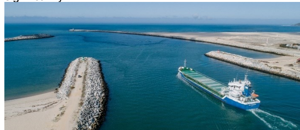
Figure 2 - Figueira da Foz harbour. North and South breakwaters and jetties of the river Mondego mouth.

With around 900 metres of quay available for handling the most diverse types of cargo and accessible to ships up to 120 metres in length and 6.5 metres in draught, the Port of Figueira da Foz has a vast area of embankment. General breakbulk and bulk cargo occupies a prominent place in the port, which offers excellent conditions for the import and export industries of the Centre Region. The Figueira da Foz harbour is protected by two breakwaters, North and South, and there are also two jetties at the river Mondego mouth (Figure 1 and Figure 2). The breakwaters and the jetties have intense pedestrian use, and in some areas, there can even be vehicles. The harbour entrance has some accretion problems, and the bathymetric conditions can vary significantly.