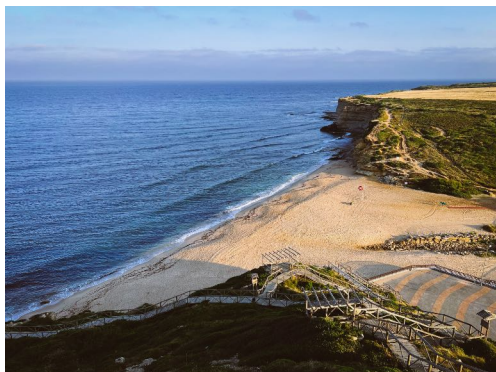
Fig.1: Ericeira coastline: Ribeira d'Ilhas beach and surf school.

The World Surf Reserve (WSR) Ericeira, Portugal was established by the Save the Waves Coalition in 2011. The goal of this initiative is to preserve the surf waves and maintain the local coastal environment without further development. Recently, formal plans for preserving the Ericeira coastline were announced by the WSR Ericeira and the Local Stewardship Council. In this spirit, the EEA Portugal funded project "Coastal Wave Modelling in the World Surfing Reserve of Ericeira" works on delivering detailed wave information using state-of-the-art numerical wave models. With crucial importance to the local community in relationship to surfing, tourism, offshore wind and fishing activities, while maintaining the environmental goals of the WSR, a better understanding of the coastal wave processes is needed.