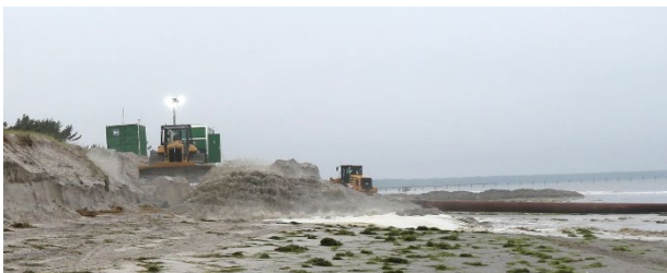
Figure 1 - Dune and beach nourishment near Prerow 2023

For more than a hundred years, coastal authorities responsible for protecting the shallow and sandy German Baltic Sea coast, rely on a nature-based protection concept, consisting of dunes covered by vegetation and locally combined with groynes. Regular dune profiles (cross-sectional) usually contain a fixed safety part of 10 m, a reserve part (volume decrease in a 200 year’s event according to an idealized cross section) and a wearing part (local volume loss per year x10 years). Because it is highly dependent on local exposition, the total cross section can differ from 14 m to 56 m (Newe 2019). They are renewed by nourishment of marine sands at latest when the wearing part is eroded (Figure 1) on the average scale of 500.000 m 3 sediment for 4 million € per year.