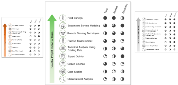
Figure 1 - Social, environmental, and economic co-benefit valuation methodologies, arranged by the time, budget, and expertise required to utilize the techniques.

The Retrofitting guideline also aims to: