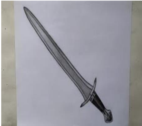
3. (Sword-straight sword)

- Qılıc [gilij]-sword. The frequency of use of this word in Gorgud studies is shown as follows: "173 times in the form of "qılıc [gilij]-sword", 1 time in the form of "qılinc [gilinj]-sword"" [Mammadova, A. 2009, p. 18].