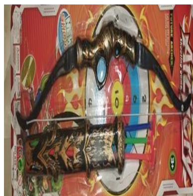
2. Sword-bow-arrow quiver

Although some of the names of weapons that differ in intensity in "Kitab" are not used in our modern literary language, they are preserved in our dialects: sapand [sapand]-slingshot, taraqa [taraga]-explosion... One detail should be noted here: the appellation of the oikonym "Sadagli" in the system of Borchali toponyms is combined in the same line with the word of "sadaq [sadaq]- arrow quiver" in the "Kitab" which confirms that the name of the weapon lives in a petrified form in the toponymic unit.