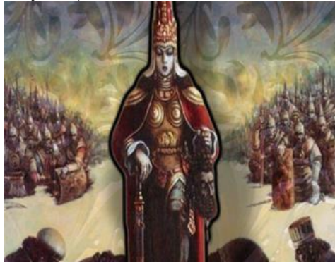
Figure-7 (6th century b.c.-Tomris Khatun)