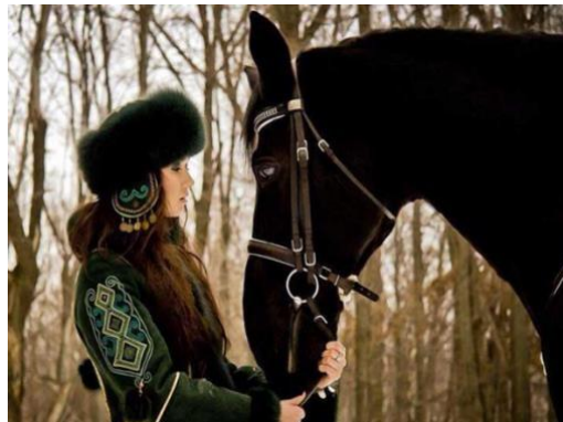
6. Turks who domesticated horses

Therefore historically in Turkish society, there have been Turkish women who stood out for their courage,