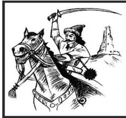
4. Curved sword