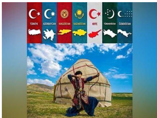
5. Women during training

Turkish peoples are fighter by nature. Many terms related to the battlefield were created by the Turks, and the horses, which are the main tool in the battles and formation of cavalries, were tamed by the Turks. Even not only boys but also girls were taught the secrets of (figure 5; 6) military art from childhood.