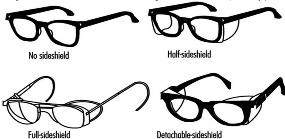
Figure 1 common types of glasses for eye protection with side screens or without protection.

A wide range of professions requires eye and face protection: risks include volatile particles, smoke or corrosive solids, liquids or vapors in grinding, grinding, cutting, blasting, grinding, galvanizing, or various chemical operations; against intense light as in laser operations; and ultraviolet or infrared radiation in welding or furnace operations. Of the many types of eye and face protection, there is the right type for each risk. For some serious risks, it is preferable to protect the entire face. When necessary, hood or helmet-type face guards and face shields are used. Glasses or goggles can be used to specifically protect the eyes.