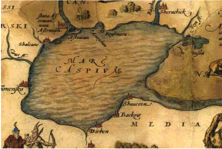
The Caspian Sea on the European map of the 15th century.

The situation in this region changed radically after the establishment of the Ottoman state on the territory of the former Byzantine Empire in the middle of the 15th century.