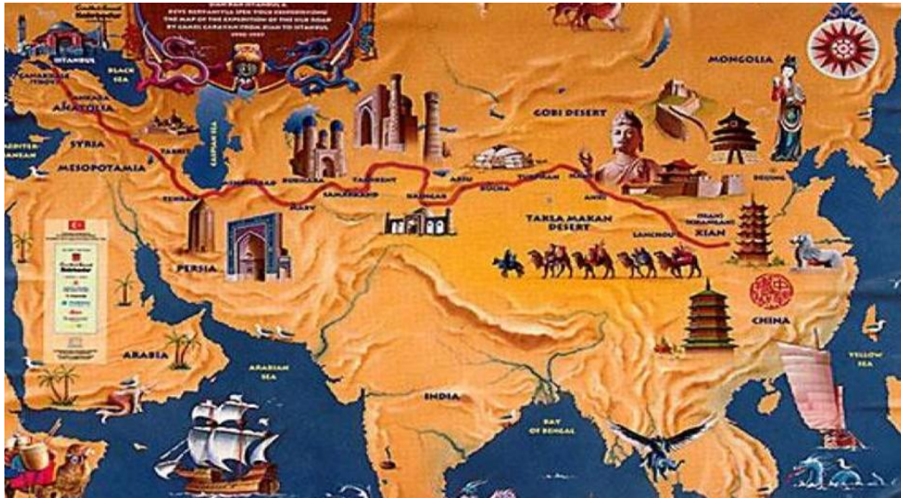
The caravan route from China and India through Central Asia to the Caspian Sea along the Great Silk Road. Middle Ages.

dragged to the Volga, then sailed along it to the capital of the Khazar Khaganate where they were taxed 10% of the value of their goods and sailed further on their ships along the Caspian Sea [9, p.73].