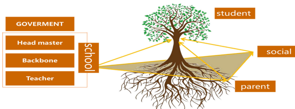
Figure 1. The main body of education