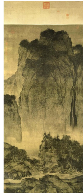
Figure 2. Traveling in the Streams and Mountains

As an important subject in literati painting, landscape painting conveys the painter's thoughts and pursuits of nature, life and philosophy through the depiction of natural landscapes. It focuses on expressing the magnificent beauty and grandeur of nature, emphasizing the painter's pursuit of the beauty of nature and his aesthetic interest in life, and at the same time, through its regional characteristics and cultural heritage, it expresses the sentiments and praises of native life and natural emotions. Landscape painting has an important position in the history of Chinese painting, which not only shapes the unique Chinese art style, but also becomes an important part of Chinese culture.