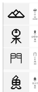
Figure 3. Visualized font design, 2019

The visual design of fonts includes stroke visualization, overall visualization, adding images, and labeling images. Image design is the most important feature of Chinese characters, as shown in Figure 2. Visualization design should pay attention to the position of specific images in the text and the relationship between graphics and text. Subsequently, there is the intentional design of fonts, as shown in Figure 3. When designing "mountain" characters, "fruit" characters, "door" characters, and "fish" characters, the intentional design of fonts is used. It emphasizes typical features or prompts to artistically process the text, that is, to associate the characters to be designed to form an abstract intention of the font.