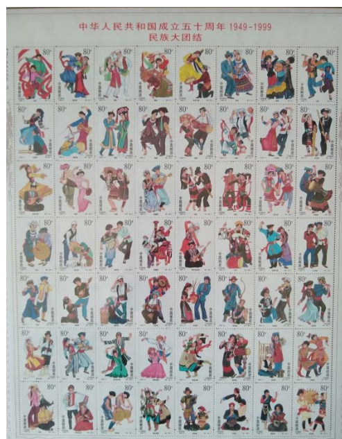
Figure 9. 56 Design of Ethnic Stamp Patterns, 2019