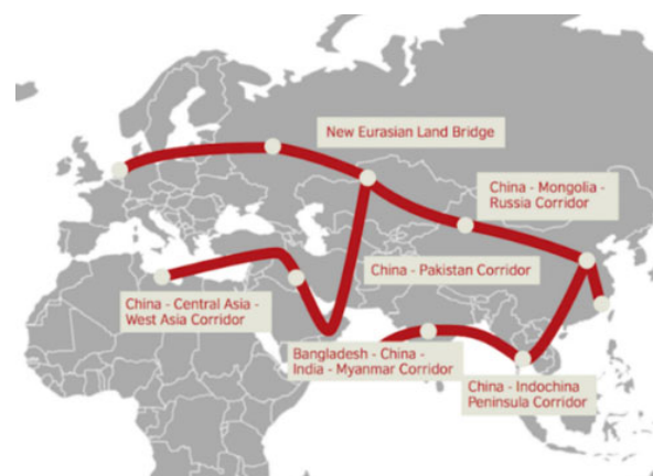
Figure 1. The transformation of China's higher education internationalization under the background of "One Belt One Road"

learning and to create a future-oriented, world-oriented, open and inclusive cooperation model with high development feasibility. In the new historical period, to seize the opportunity of "the Belt and Road" to further deepen the reform of higher education and cultivate international-oriented professionals, it is necessary to think deeply about the internationalization and transformation of China's higher education., see Figure 1.