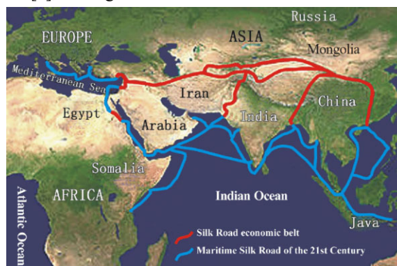
Figure 1. Chinese grassland Silk Road

Southwest Silk Road running through the mountains in the southwest; the fourth is the grassland silk road. The road crossed the desert in the north. These four ancient passages constitute the world-famous "Silk Road" transportation network[3], see Figure 1.