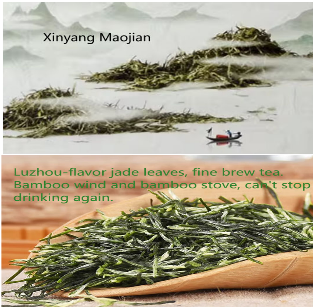
Figure 4. Tea graphic packaging effect

As can be seen from Figure 4, the use of text to introduce the long history of Zhenmaojian, tea-making technology, and corresponding traditional patterns, so that consumers can understand the history of Xinyang Maojian, and produce stronger appeal and attractiveness. At present, graphic and text matching is a common form of Xinyang Maojian tea design. In the process of using graphic elements, market research should be carried out, and corresponding graphic content should be added according to consumer needs, so as to enhance the regional and characteristic characteristics of the pattern and form a good cultural resonance with consumers. At the same time, when using graphic elements, avoid singleness and homogeneity, so that Xinyang Maojian has multiple cultural attributes, presents unique cultural connotations, enhances the cultural value of Xinyang Maojian, and promotes the development of Xinyang Maojian.