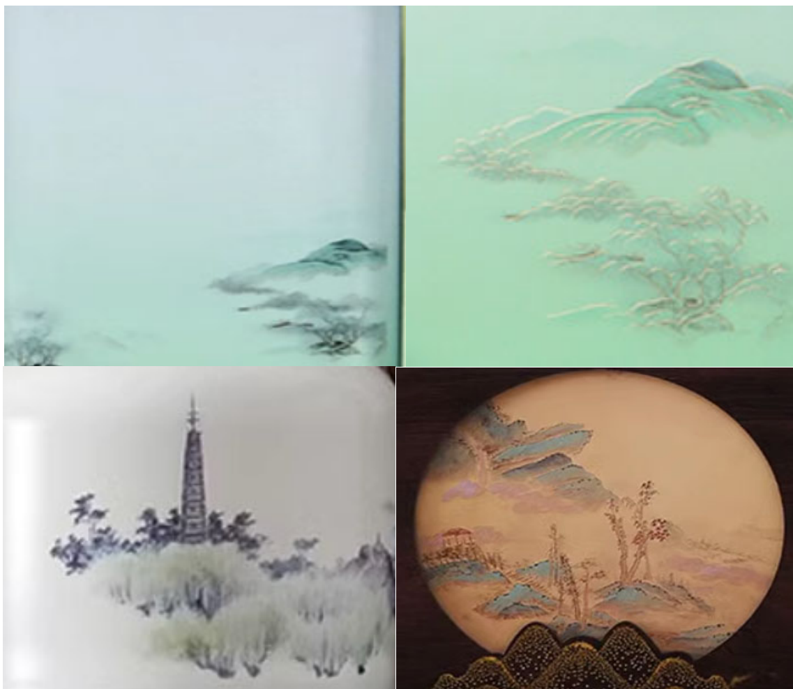
Figure 3. Patterns in foil packaging

made on the basis of green. When the color of packaging design is integrated, you can focus on the color of wood, and use cold and warm contrast for color design, which can not only enrich the color of the packaging, but also improve the grade of the packaging. In order to ensure the quality of the Xinyang Maojian tea, white is used to reduce the heat absorption of the package. For example, making Xinyang Maojian tea into a small can of tea will improve the storage effect of Xinyang Maojian tea and also improve the grade of packaging, as shown in Figure 3.