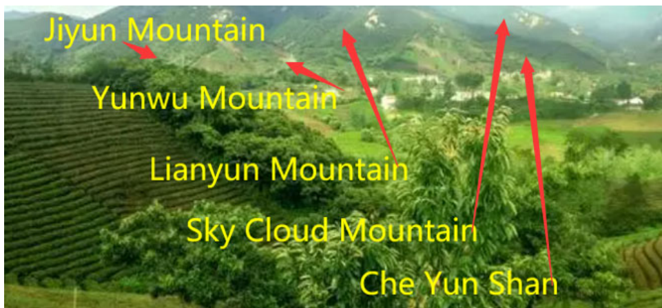
Figure 5. Characteristics of Maojian area

In packaging and printing, Xinyang local cultural characteristics are cleverly reflected, and Xinyang culture is uniquely designed, such as adding the main production area of Xinyang Maojian as an element to the outer packaging to enhance Xinyang's cultural image. This is shown in Figure 5.