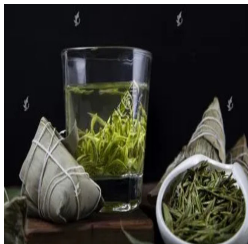
Figure 6. Dragon Boat pattern

In the design of Xinyang Maojian packaging gift box, it is also necessary to reasonably add traditional festival cultural content, increase the cultural texture and design sense of packaging, change the design style, and reflect the connotation of cultural festival. It can also add modern festival culture, for example, Xinyang Maojian Cultural Festival is a good cultural element. Statistics show that Xinyang Maojian energy saving attracts 45 million people every year. Among them, Xinyang Maojian cultural lectures,