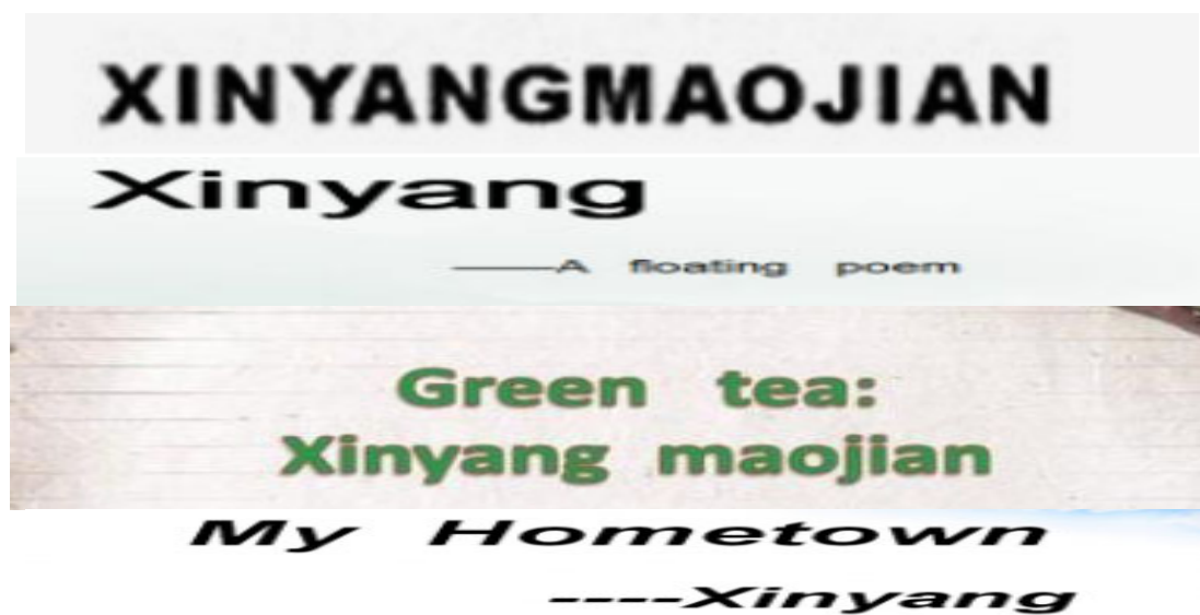
Figure 2. Such as 4 different fonts of Xinyang Maojian tea

In the long river of thousands of years of history in China, rural traditional culture is representative, reflecting local folk customs and customs. Rural traditional culture is the precipitation of customs and customs, which are presented in various fonts and patterns, as shown in Figure 2.