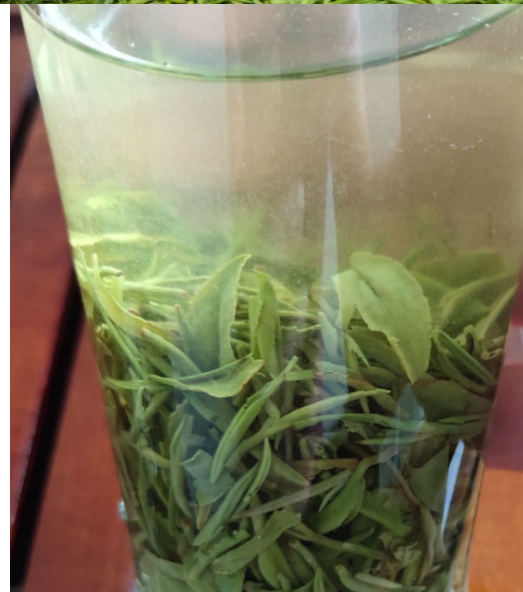
Figure 7. Xinyang Maojian Cultural Festival

In the packaging design process, it is necessary to reflect the cultural meaning of elegance, wealth and upwardness, and match the appropriate objects, using traditional cultural orientation, so that consumers can feel the cultural tone of Maojian. When designing and customizing the gift box, the packaging design can be carried out according to the needs of different festivals, for example, the Mid-Autumn Festival can carve the moon viewing scene on the packaging gift box, and the Chongyang Festival can draw the chrysanthemum picking scene in the packaging gift box, highlighting the luxury and high-end sense of packaging quality, and giving the packaging gift box a strong traditional cultural atmosphere. When designing Xinyang Maojian packaging, all festivals can be used as a source of inspiration, and the festive elements are used reasonably, reflecting the cultural concepts and spirit behind different festivals, and enhancing the personality of Xinyang Maojian packaging design.