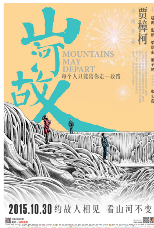
Figure 6. Poster of The Hills and the River