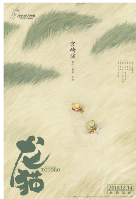
Figure 4. Poster of Totoro