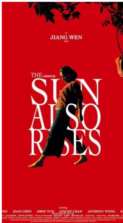
Figure 1. Poster of The Sun Also Rises