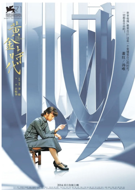
Figure 2. Poster of The Golden Age