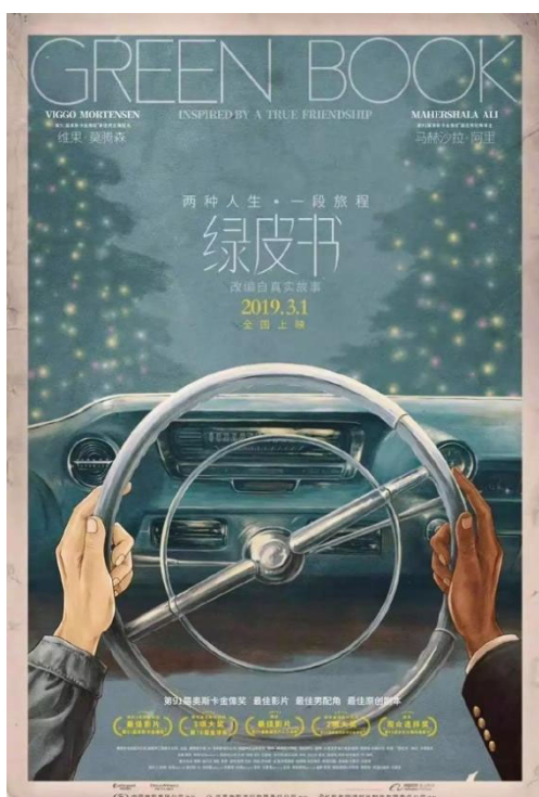
Figure 5. Poster of Green Book

mostly expressed in the form of surreal, illustration and so on. In the movie poster "Green Book" designed by Huang Hai (Figure 5), the hands of Tony, a white driver, and Shirley Tang, a black pianist, share the same steering wheel as the main visual, and the surreal approach makes the whole atmosphere reach a new height. In the movie plot, the black community suffers from various injustices in the American South, and they need to follow the inns and restaurants stipulated in the Green Book, where the title of the Green Book movie is also a historically realistic guide to black action. The differences in skin color and culture collide in the plot of the movie journey, and the entanglements of the movie themes are also reflected in: racial discrimination, master and servant status, family relations, etc. Complex narrative themes, Huang Hai in the poster design to transcend the reality of the two main characters in the key imagery steering wheel for integration. The narrative theme of the scene atmosphere is mostly based on the plot of the movie. The poster of the movie "The Hills and Rivers" (Figure 6) narrates Shen Tao, Dagger Le and Zhang Jinsheng standing at different angles looking into the distance, and the imagery of the distance is full of the unknown. The poster uses the decorative form of wood panel carving in its creation, expressing a new and old temperament. This strong difference in color and material triggers the audience's imagination of the film's plot.