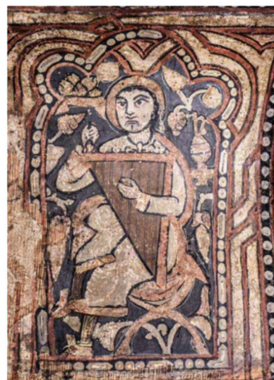
Figure 10. Musician tuning a triangular Psaltery, Palermo, Cappella Palatina: Nave ceiling, Muqarnas, North-eastern corner unit, panel 27

in illuminated manuscripts. [16] David was known for his military conquests, the centralization of control, and the establishment of a new capital, following a similar power trajectory to Roger. Therefore, using this model could be an attempt to parallel Roger with biblical characters to give him divine legitimacy. Notable is how the triangular psaltery has eight strings. Under Christian contexts, the number eight represents resurrection and holiness, which surpasses nature. [24] Hence, the transcendental quality and connotation of new beginnings match with the religious purpose of the chapel while also serving as a subtle blessing for the newly established Norman rule.