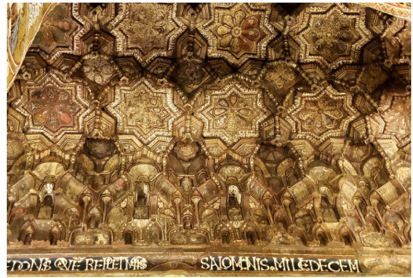
Figure 4. Detail of the muqarnas ceiling, Cappella Palatina, 1130-43, Palermo