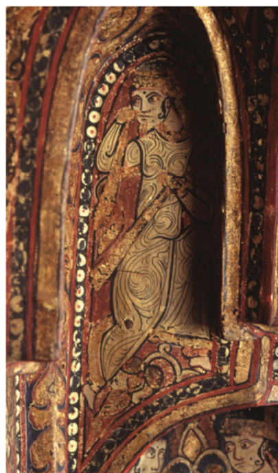
Figure 7. Women dancer performing a sleeve dance, Cappella Palatina, Palermo, 1140

Painted on the ceiling of the Cappella Palatina are 19 dancers in motion, mostly wearing closely fitted tops and loose trousers with golden hems (fig. 7). In Islamic and Byzantine art, gold hems indicate luxury. [23] Therefore, the richly decorated clothing could enhance the wealth and opulence of the Sicilian Norman court, reflecting the power of its patrons. Indeed, striving for pomp was not rare under Roger II's governance. In the Abbot Alexander of Teles's chronicle of 1135, he captures the lavishness of Roger's coronation by stating, "The glory and wealth of the royal abode were so spectacular that it caused great wonder and deep stupefaction". [13]