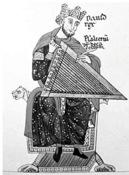
Figure 11. King David: David rex. Psalterium dicitur decacordium. From the Hortus Deliciarum of Herrad of Hohenbourg

The presence of 27 crosses distributed across the ceiling of the Cappella Palatina reinforces the sense of Christian solemnity. [21] The Christian iconography is often strategically positioned so that they are the foci. Thus, despite the paintings having a heavy focus on Islamic features like the traditional palatial cycle, their placement in more peripheral positions on