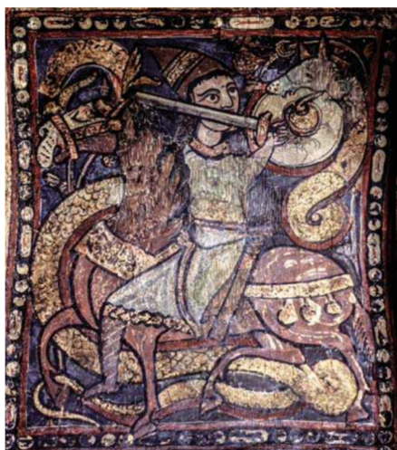
Figure 9. Marvellous combat between horseman and dragon, Palermo, Cappella Palatina, Nave ceiling, muqarnas, south side, Large unit 18, Panel 14

Scholars such as Johns and Kapitaikin have also identified the presence of Byzantium, Coptic Egyptian, Syrian, East Christian Mesopotamian, and Sicilian Christian sources on the ceiling of the Cappella Palatina. [16] Some examples of Christian scenes include paintings of a bearded horseman spearing dragon (fig. 9), David or Samson astride a lion, solar chariots at the west end and a plethora of Solomonic references in the eastern wing. [2]