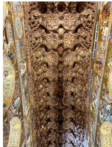
Figure 5. Eight pointed stars on the muqarnas ceiling, Cappella Palatina, Palermo, 1130-43

As the Norman kings were Latin Christians, many believe the muqarnas ceiling of the Cappella Palatina in Sicily is unique because it is an intriguing example of muqarnas decoration used in buildings for non-Muslim patrons. However, the Cappella Palatina is not the only instance of muqarnas decoration being deployed within a Christian context. There is a mouchroutas structure, which has a muqarnas vault in a honeycomb structure, constructed in the mid 12 th century Byzantine imperial palace at Constantinople. [17] Constructed two hundred and thirty years later (1377-80), the ceiling of the Sala Magna in the Palazzo Chiaramonte of Palermo also demonstrates similar architectural techniques to the ceiling of the Cappella Palatina with wood panels covering consoles inserted into the walls. [6] The examples above suggest that the medieval Mediterranean world did not view the muqarnas as a feature strictly confined within the boundaries of the Islamic world. Instead, patrons are likely to have incorporated it more so for its aesthetic purposes to elevate their prestige and enhance the grandeur of their setting. Hence, it highlights the cultural flexibility in the visual language of the medieval Mediterranean world, reminding viewers not to heedlessly categorize and demarcate motifs and characteristics into narrow margins guided by modern understandings of cultural divisions. As a result, one gains a broader perception of the interlinked historical context into