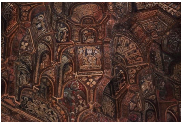
Figure 3. Detail of the motifs on the muqarnas ceiling, Cappella Palatina, 1130-43, Palermo

The muqarnas ceiling of the Cappella Palatina is constructed out of three large multifaceted three-dimensional units made up of small cells. The squinches, niches, and arches forming the muqarnas are all decorative. [7] Built from wood panels with thicknesses ranging from 250mm × 120mm to 660 mm × 430 mm, the muqarnas ceiling was initially covered with a thin coat of plaster and painted with vegetal, epigraphic, and figural motifs (fig. 3). The curved surface consists of seven levels, with twenty large units alternating with twenty-four small units (fig. 4). [16] Two rows of ten stellate octagons in the shape of eight-pointed stars interpose the three rows of eleven cupolas (fig. 5). [4] Scholars have pointed out the stylistic similarities and parallels between the spatial and geometric framework of the ceiling in the Cappella Palatina with that of North African Maghribi architecture. [7] According to the analysis of Cavallari, the vault is supported through the usage of “wedge arrangement.” [3] Further research has also revealed the presence of a concealed superstructure holding up the muqarnas. [16]