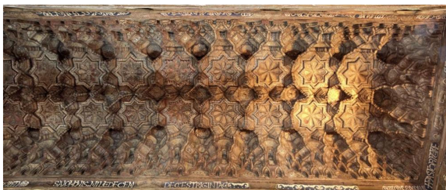
Figure 1. Muqarnas ceiling, Cappella Palatina, c. 1130-43, Palermo

Christian context, has attracted much attention and admiration from scholars and visitors alike. Extolled in the late twelfth century work Epistola...de calamitate Siciliae and by Tomasso Fazello in the 16 th century for its "outstanding elegance of the curving," the muqarnas ceiling of the Cappella Palatina is an exceptional example of refined carpentry. [1]