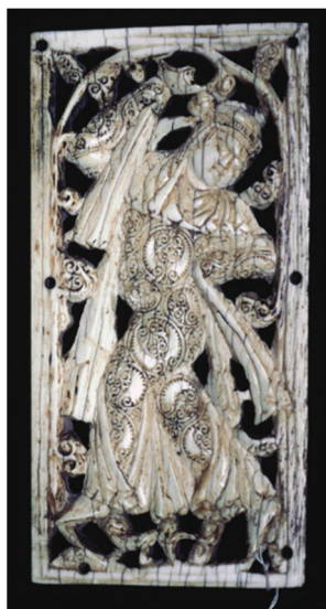
Figure 8. Women dancer performing the Asian sleeve dance, carved ivory, Fatamid Egypt or Sicily, 11 th to 12 th centuries, Florence, Museo Nazionale del Bargello

muslim powers of his time. This example of synthesizing different cultural iconography for his use demonstrates Roger's skill in creating a united visual language.