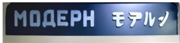
Figure 1. Bilingual linguistic landscape of Memorial of Northeast China Revolutionary Martyrs